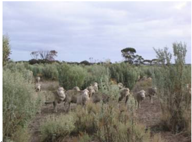
Sheep grazing saltbush in autumn