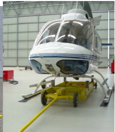
Heavy Duty – Multi Helicopter (206-206L & 407) Ground Handling Trolley