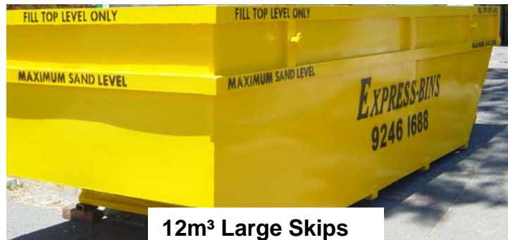
12m 3 Large Skips