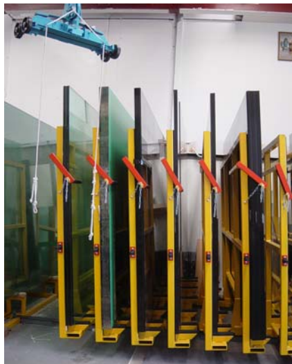
Glass Handling Mobile Racks