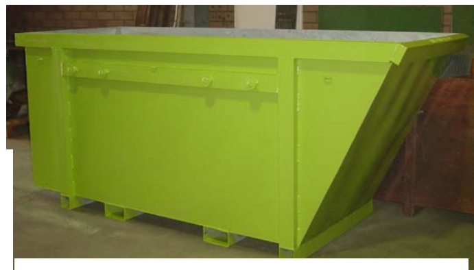
Fully Galvanized Recycle Skips