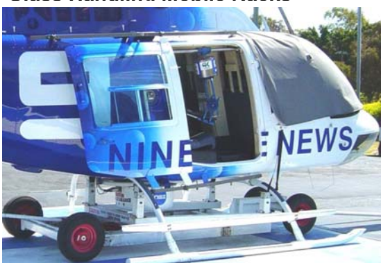
TV Camera Holder on Helicopter