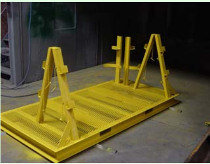
Plastic Wrap Roll Holder

We have been manufacturing different items for well known Companies such as BHP, Woodside, United Equipment and others.