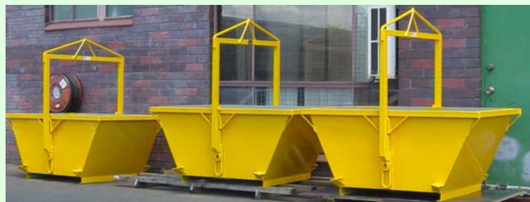
Tilt Emptying Bins

If you have any special requirement contact us and we will assist in design and manufacturing