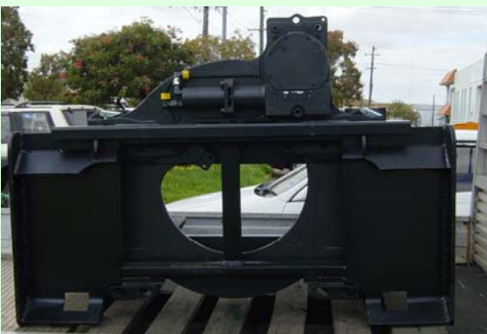
Bins Rotation Attachment