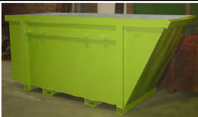
Fully Galvanized Recycle Skips