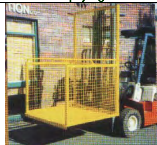
Forklift Picking Cage