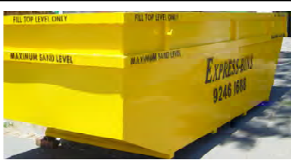
12m³ Large Skips