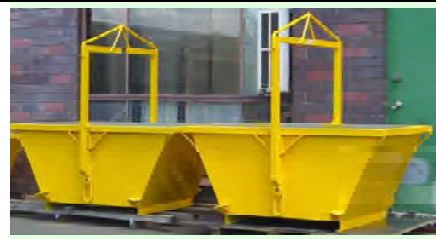
Tilt Emptying Bins