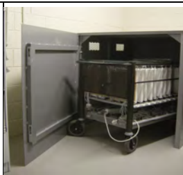
Laptop Security Cabinets