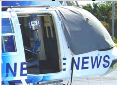
Helicopter Camera Holder