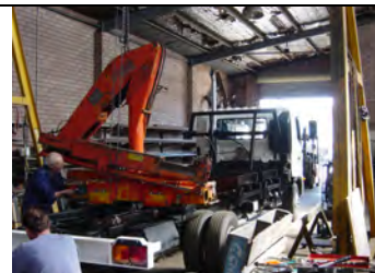
Truck' Attachment Refits