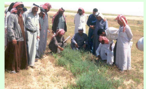
Results Salsola vermiculata planted by Chisel Seeder in Syria