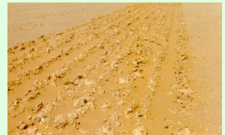
Chisel seeding Al Jouf Saudi Arabia