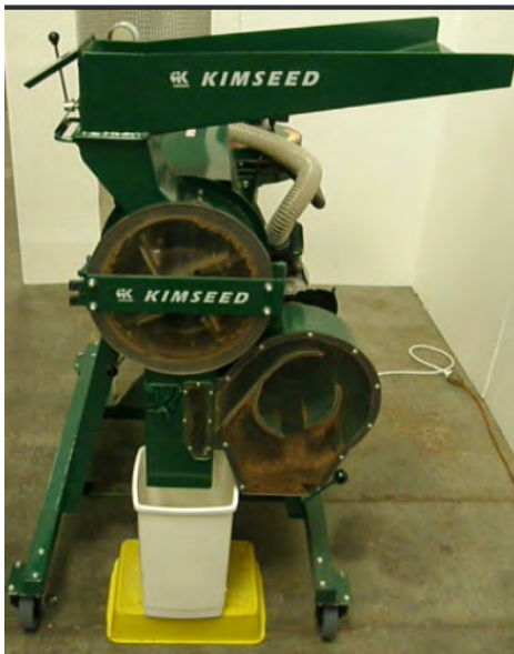
Seed threshing in progress Visual control of threshing and trash separation.