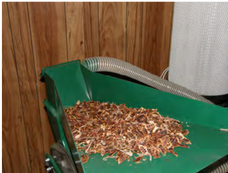
Seed feeding into thresher chamber