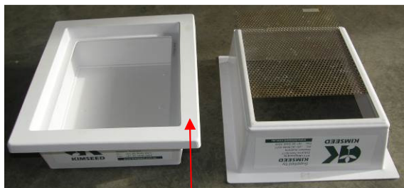
Locating Frame and Base pan