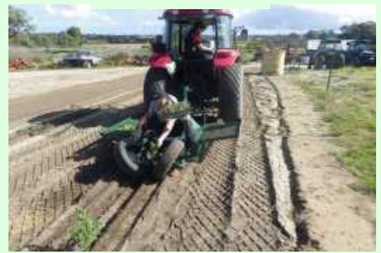
Tree Planter – tractor drawn (above) Coulter wheel and ripper (Below)