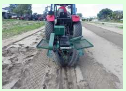
Linkage Planter with Direct Seeder