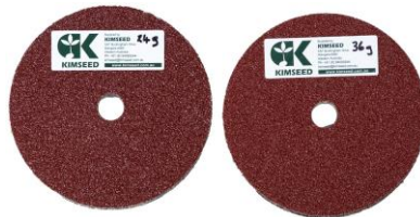
24 and 36 Grit Abrasive Discs